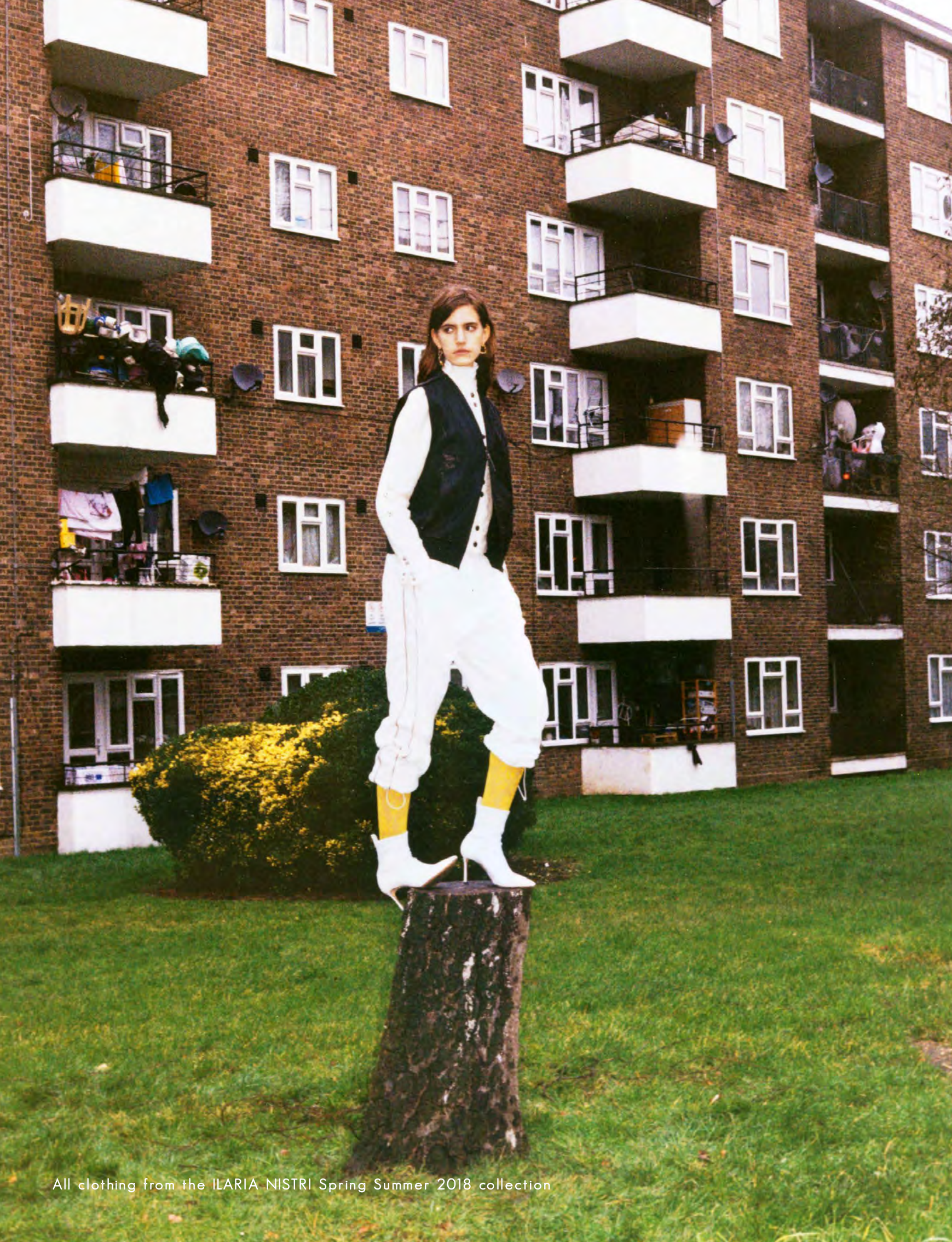
All clothing from the ILARIA NISTRÌ Spring Summer 2018 collection