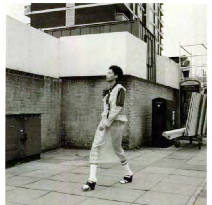
Opposite page: Cropped bustier top by ILARIA NISTRÌ. Sheer layered tights by WOLFORD. And sheer stockings by AGENT PROVOCATEUR. This page: Ruffled organza dress, nylon polo shirt, gingham shirt, crystal and feather necklace, and sports socks by MIU MIU. Leather mule sandals by VIC MATIÈ